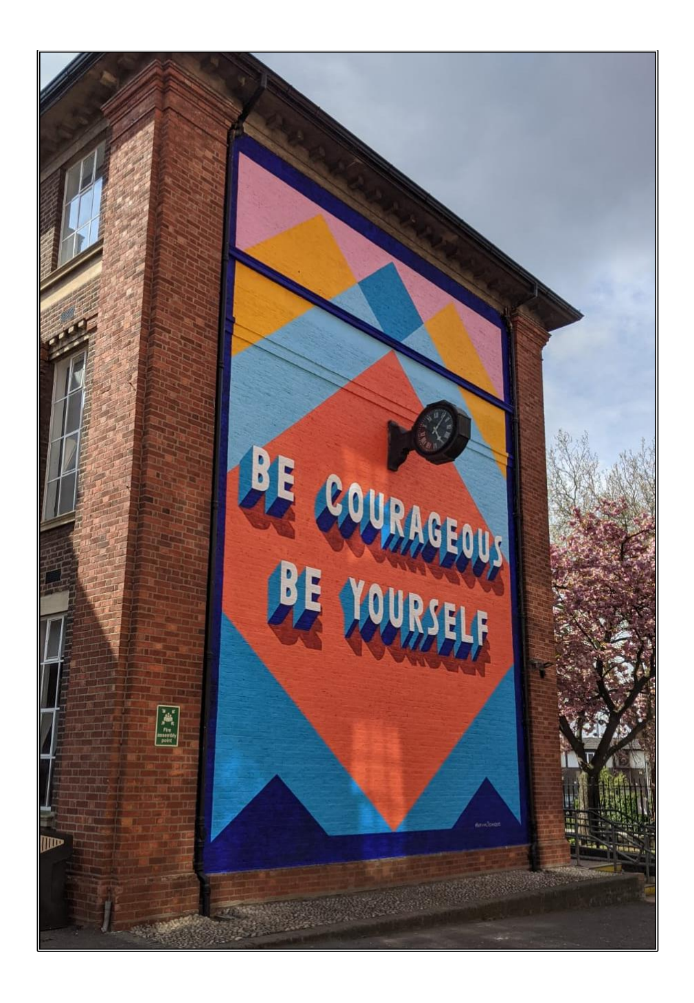
Think Big • Work Hard • Be Kind • Stay Safe