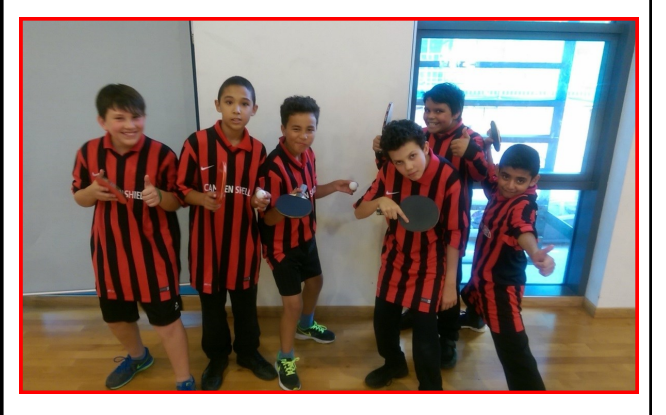
Yr 7 Table Tennis